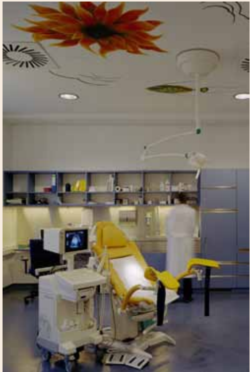
ABORTION UNDER ILLEGAL AND LEGAL CIRCUMSTANCES - FROM THE KITCHEN TABLE TO A GYNAECOLOGICAL OPERATION ROOM

This is what the Museum of Contraception and Abortion wants to achieve, especially for young people, so that they can make in-