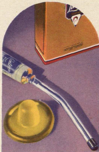
U. S. Patent 1,995,818 and many foreign patents

LANTEEN (Brown) CAP DIAPHRAGM is the latest improved design for diaphragms. One size fits all normal women. Used in combination with LANTEEN (Blue) JELLY , it offers a complete and positive protection to the wife whose health requires this safeguard.