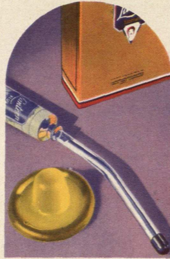
U. S. Patent 1,995,818 and many foreign patents

LANTEEN (Brown) CAP DIAPHRAGM is the latest improved design for diaphragms. One size fits all normal women. Used in combination with LANTEEN (Blue) JELLY , it offers a complete and positive protection to the wife whose health requires this safeguard.